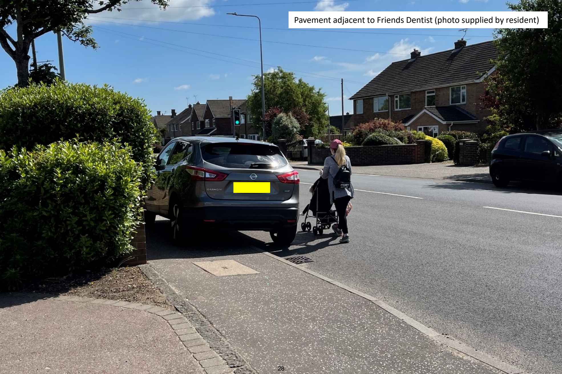
Pavement adjacent to Friends Dentist